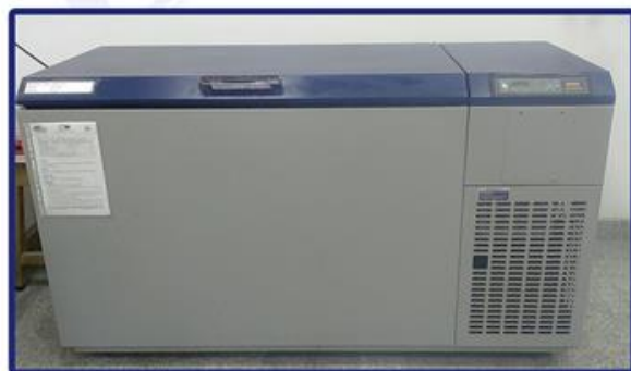
Deep Freezer -80