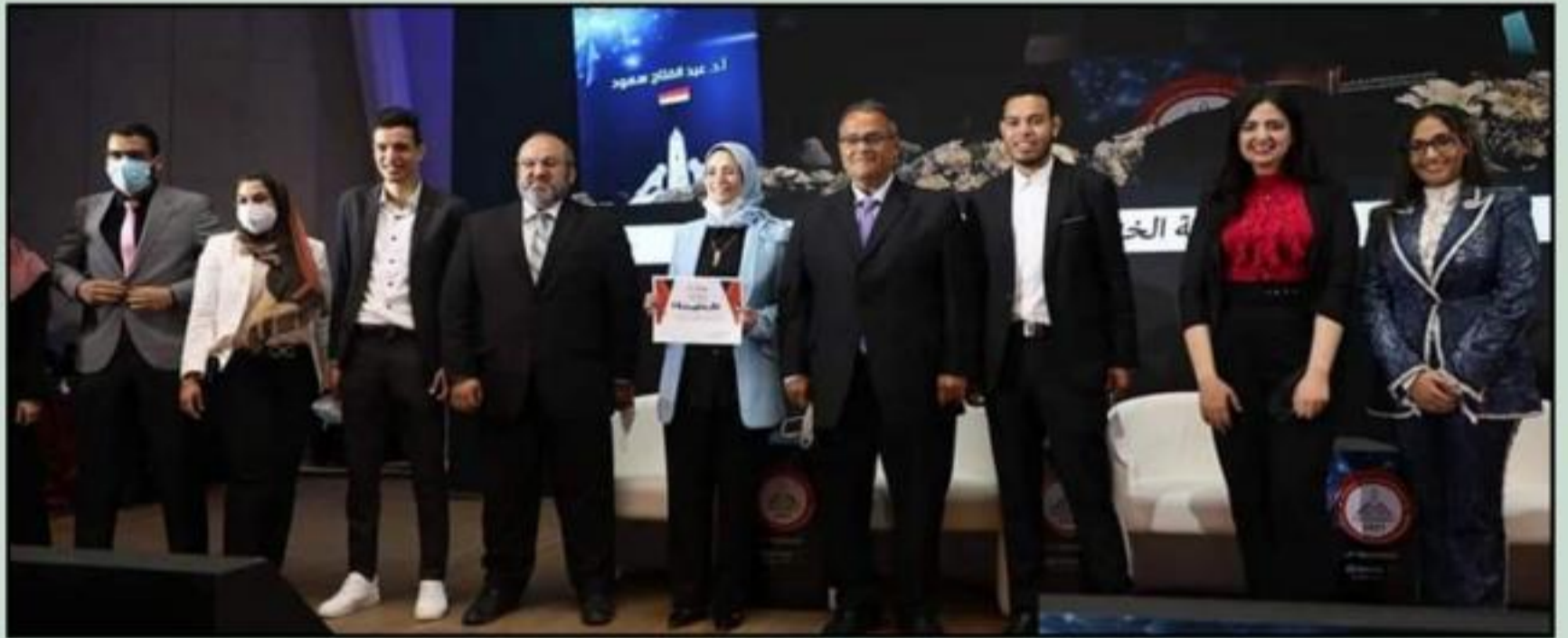
Faculty of Pharmacy Ain Shams University congratulates their smart students in attaining the BEST EXHIBITION in 9th International Conference "The fourth Generation of Universities between Reality and Aspiration" April- 2021